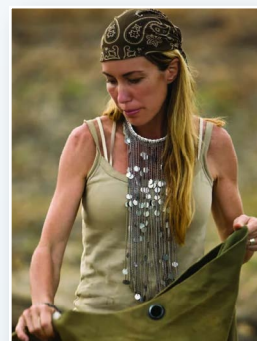
Dr. Mireya Mayor

This seated breakfast program will feature Dr. Mireya Mayor – hailed by The New York Times as “The Female Indiana Jones.” Dr. Mayor is a primatologist, explorer, and Emmy Nominated TV host. What she is not is typical!