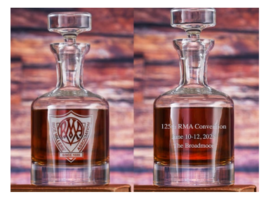
Crystal Decanter This heavy crystal decanter holds 28 ounces of your favorite spirit. $150