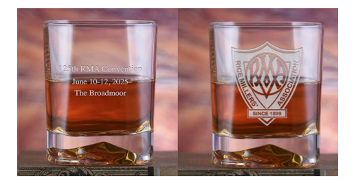
Luigi Bormioli Rock Glasses Set of two heavy weight rocks glasses. $70 per set

Commemorative glass set and decanter featuring the vintage RMA logo and 125<sup>th</sup> RMA Convention details deep-etched sand carved on the front and back.