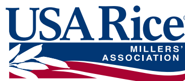
PHOTO RELEASE: Any photographs taken at convention events by RMA/USA Rice may be used in publicizing RMA/USA Rice events including this and future conventions.